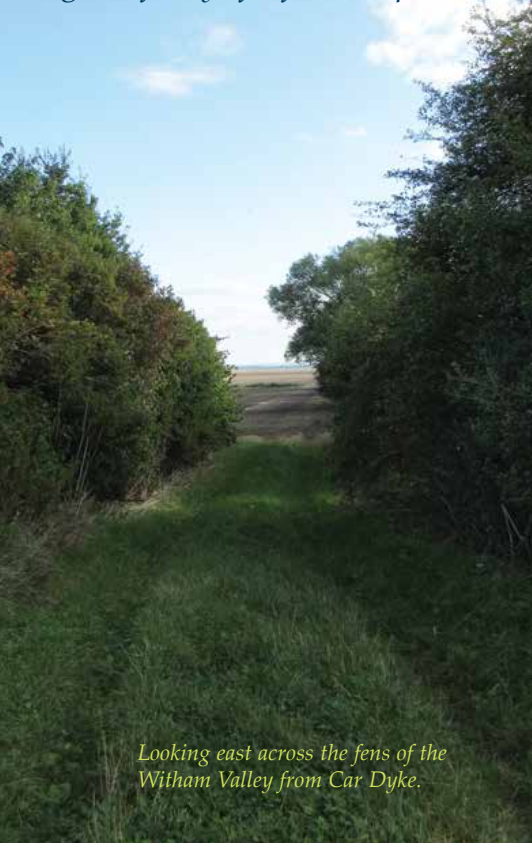
Looking east across the fens of the Witham Valley from Car Dyke.

The landscape, history and rights of way of a fenland parish