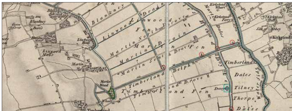
Martin in 1856. Windmills (red circles) pumped water off the fen into the drains, and new dwellings shelter farmworkers on the new fields. What was to become Metheringham Airfield is largely empty; 'Gorse Cover' suggests rough heath vegetation. Note the wharves on Car Dyke and the Witham, and the Decoy (blue), a man-made pond on which waterfowl were lured into nets.

Today Martin continues to grow as people who work in Lincoln and elsewhere choose to live in this pleasant village set in an historic agricultural landscape.